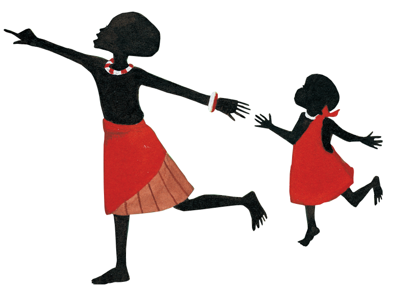
Illustration © Julia Cairns from We All Went on Safari